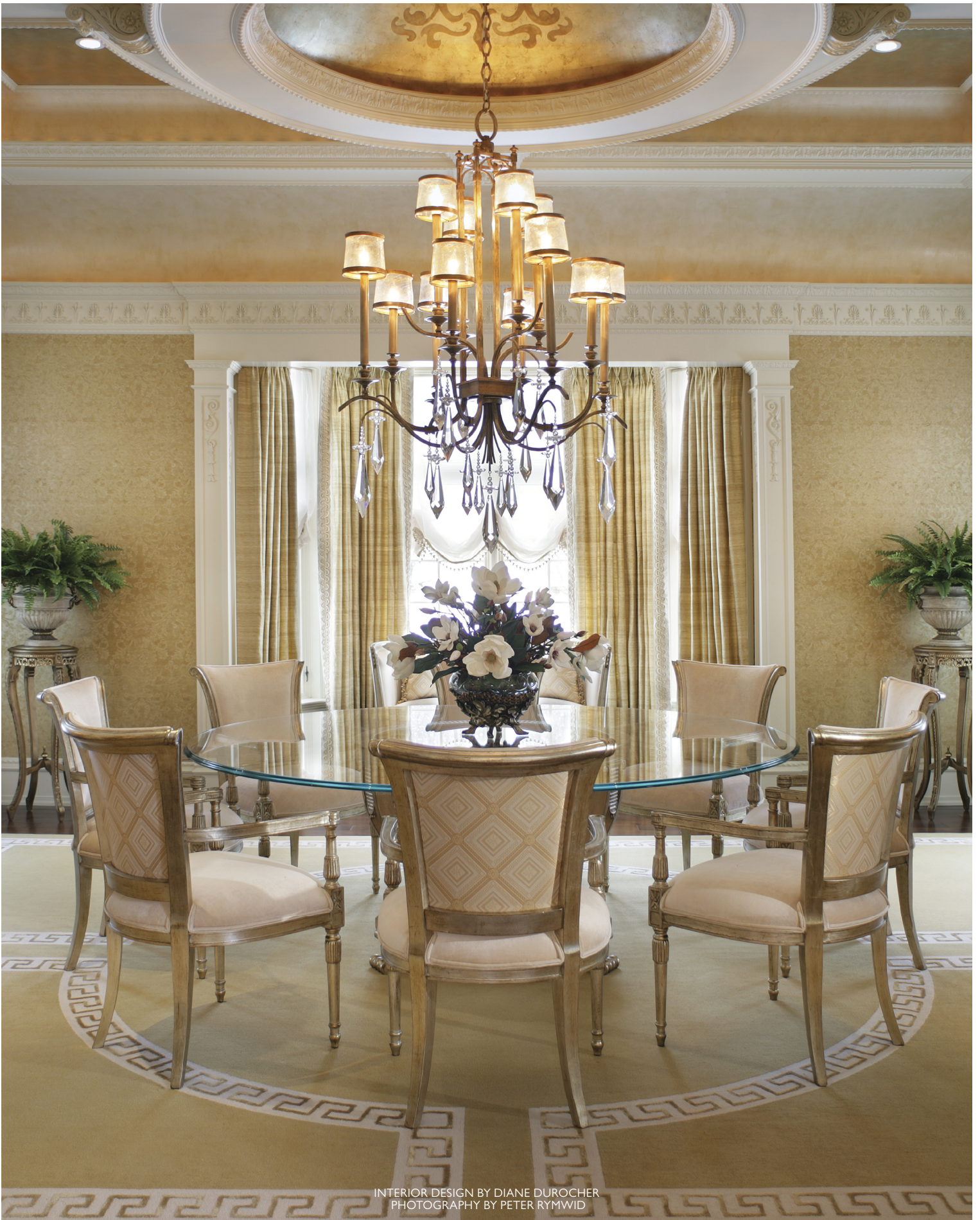
INTERIOR DESIGN BY DIANE DUROCHER